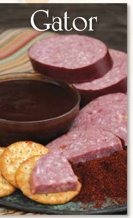
7156 - Cajun Honey BBQ Gator Sausage The best cajun honey BBQ gator and pork sausage you will ever taste. 9 ounces.

Wondering what's inside? Spoiler alert: It's a chance to support our fundraiser!