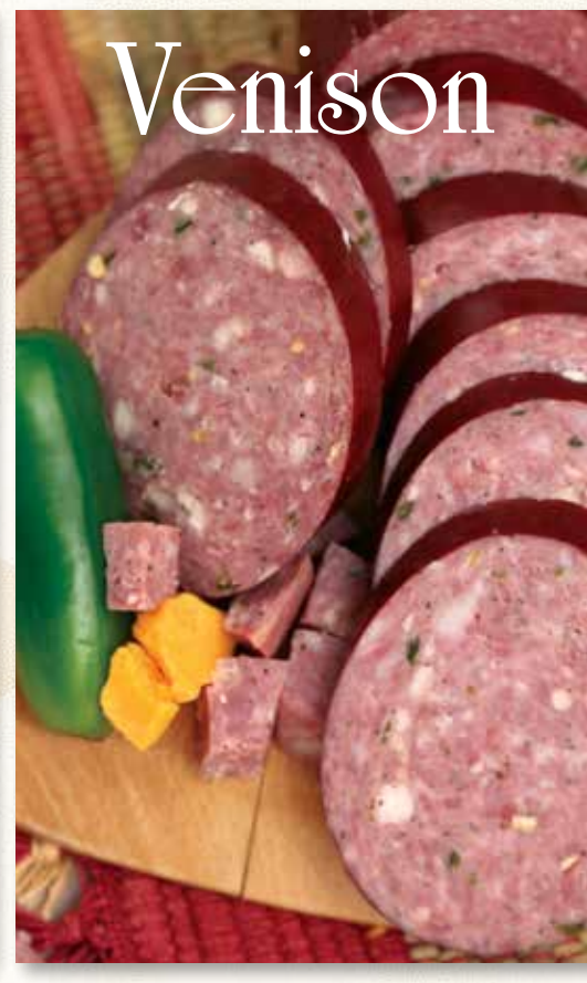
7158 - Jalapeño Cheddar Venison Sausage Venison mixed with pork, jalapeños and cheddar, Gluten free, 9 ounces,