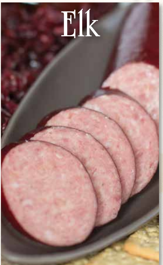
7157 - Cherry Maple Elk Sausage Elk and pork mixed with spices, maple, and cherry. 9 ounces.