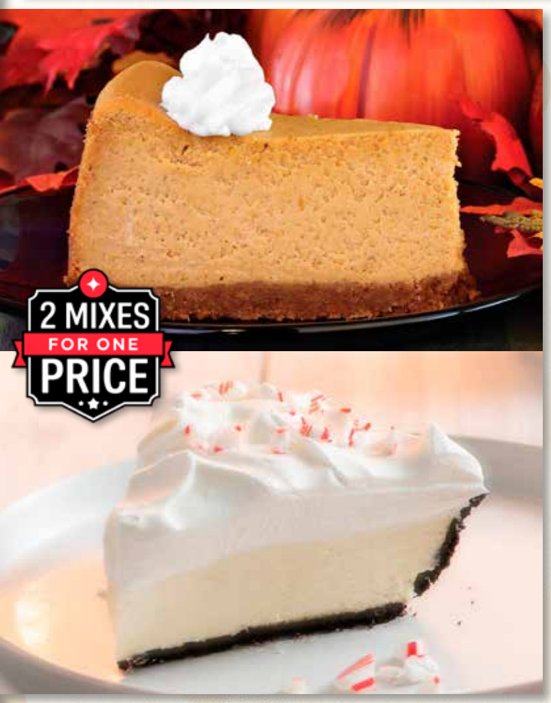
4012 - Pumpkin Pie Cheesecake & Peppermint Cheesecake Duo Bake Mixes

A creamy pumpkin cheesecake and peppermint cheesecake mix. Both are sure to be a hit at holiday gatherings! Add: cream cheese, whipped topping, graham or chocolate pie crust. Each serves 8.