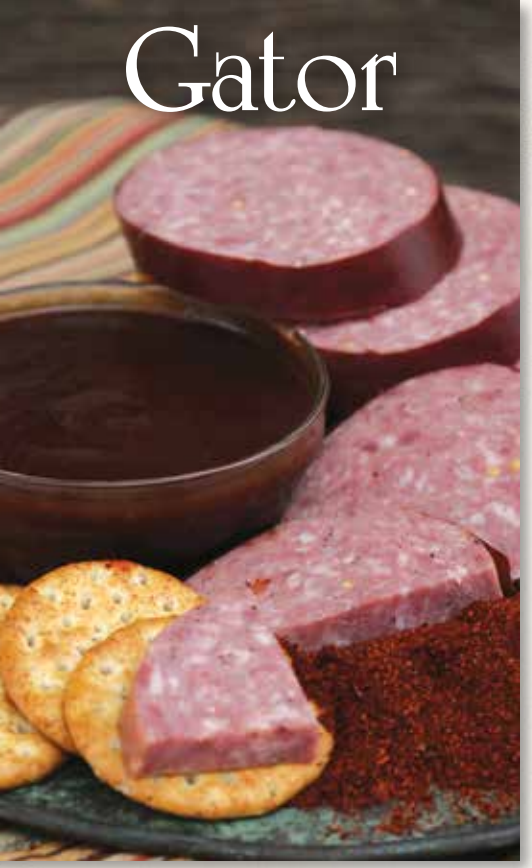
7156 - Cajun Honey BBQ Gator Sausage The best cajun honey BBQ gator and pork sausage you will ever taste. 9 ounces.

Wondering what's inside? Spoiler alert: It's a chance to support our fundraiser!