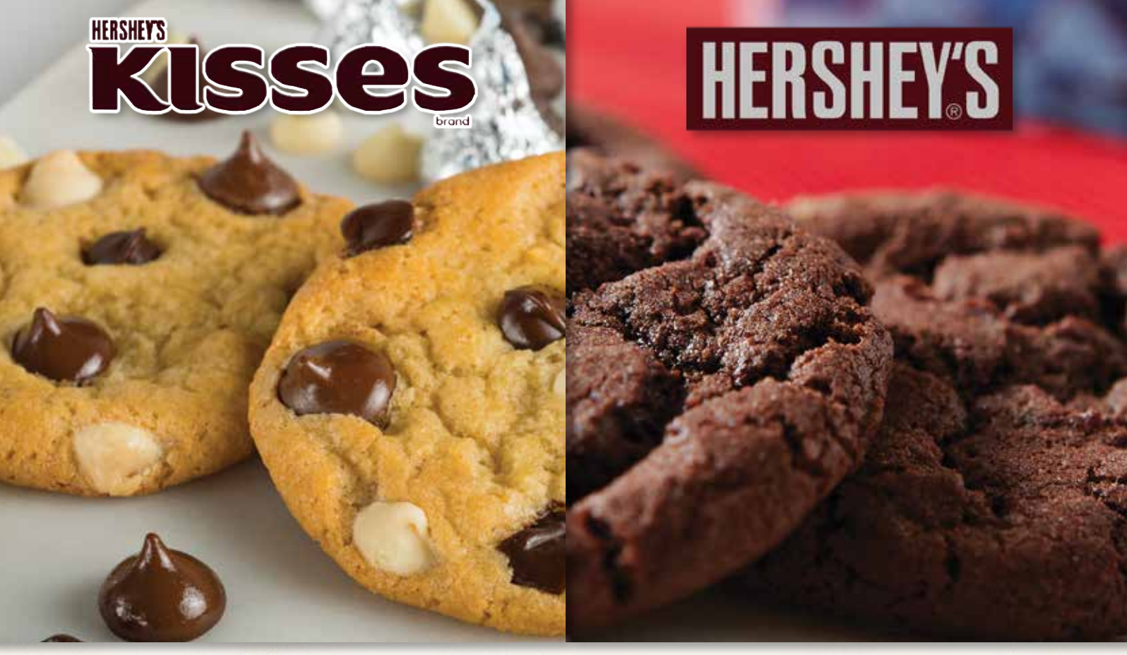
716 - Chocolate Lovers Combo! Triple Chocolate & Double Chocolate Brownie Why choose? 24 Triple Chocolate with Hershey's ® Mini Kisses and 24 Double Chocolate Brownie with Hershey's ® . 48 preportioned cookies total in a 2½ pound box.