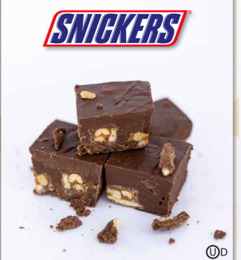
6873 - Snickers® Chocolate Fudge A mouth-watering chocolate fudge loaded with real Snickers® pieces and roasted peanuts.