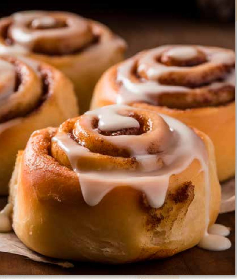
325 - Cinnamon Rolls The right combination of cinnamon & brown sugar! Topped with fondant icing. 20 ounce 4-pack.