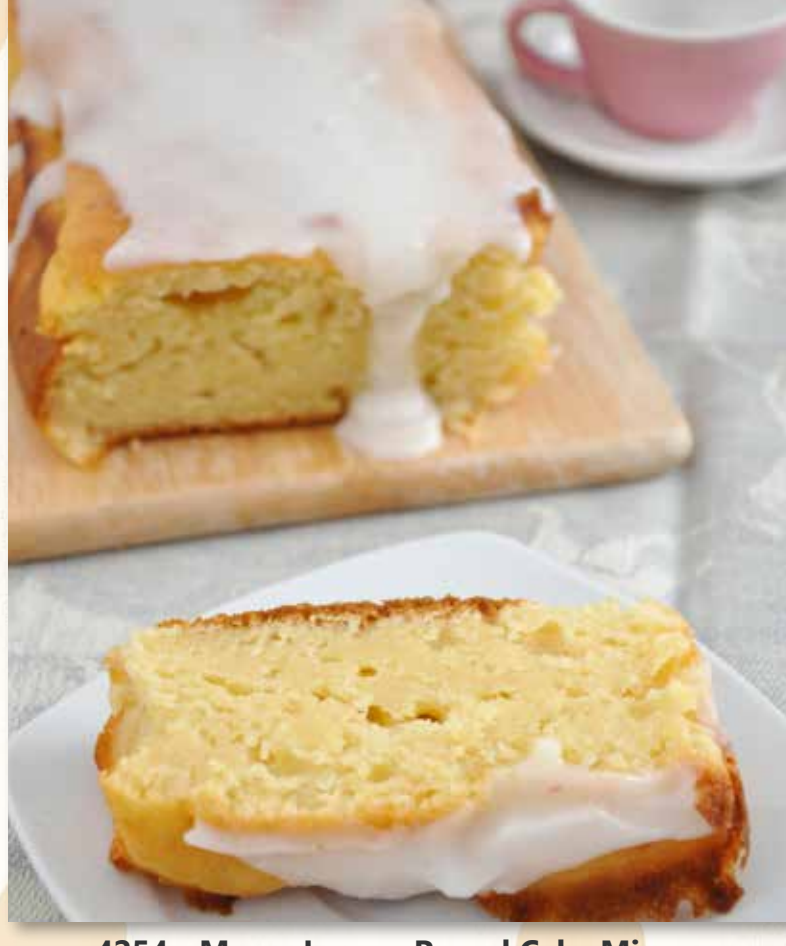
4254 - Meyer Lemon Pound Cake Mix Moist & buttery! Meyer lemons, mandarin oranges, lemon glaze. Yields: one loaf. Add: Butter, Eggs, Milk. Serves 10.