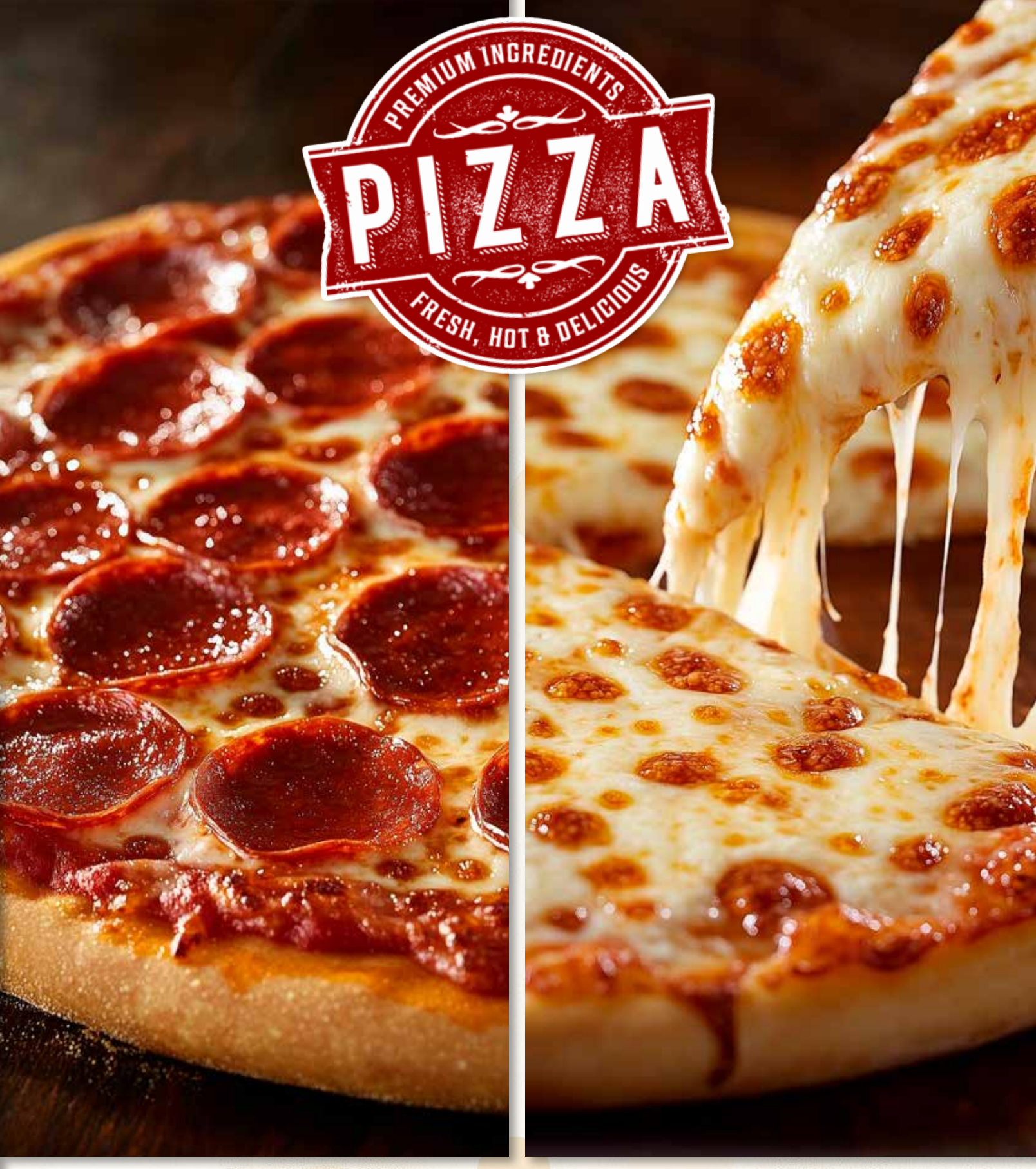
460 - 12" Artisan Par-Baked Pepperoni Featuring a traditional crust that's partially baked to lock in that authentic pizzeria texture. Topped with premium pepperoni, rich tomato sauce, and a blend of melted cheeses, this 16.4 oz pizza delivers restaurant-quality taste straight from your oven.