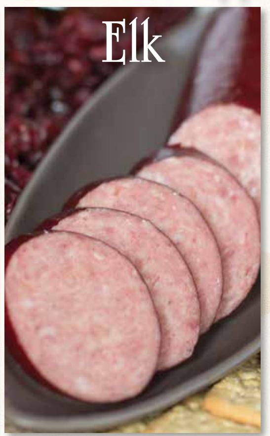
7157 - Cherry Maple Elk Sausage Elk and pork mixed with spices, maple, and cherry. 9 ounces.