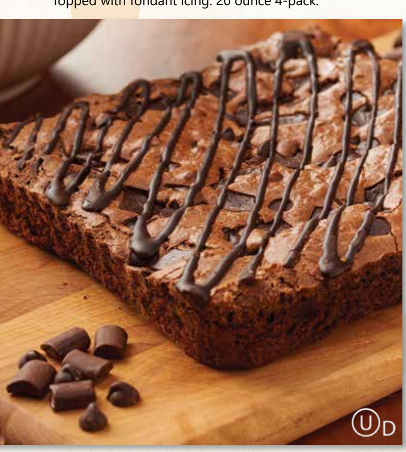
345 - Chocolate Overload Brownies Semi-sweet chocolate chips swirled into dark chocolate brownie batter! 26 ounces.