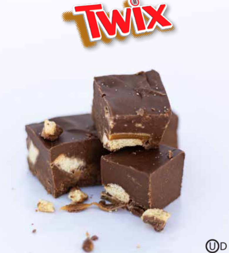
6874 - Twix® Chocolate Fudge Chocolate fudge made with lots of pieces of Twix®, which means crunchy cookies, caramel, and milk chocolate.