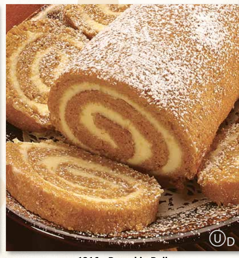
A rich and moist pumpkin roll swirled with a luscious cream cheese filling. 8 inch roll.