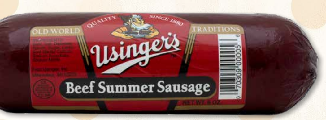
7161 - Beef Summer Sausage

Protein packed snack made with the best beef and spices. Gluten free. 8 ounces.