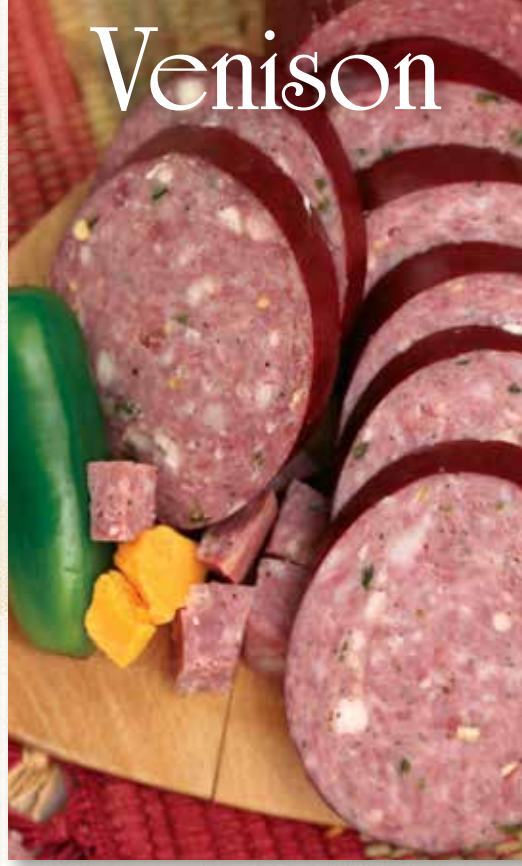
7158 - Jalapeño Cheddar Venison Sausage Venison mixed with pork, jalapeños and cheddar, Gluten free, 9 ounces,