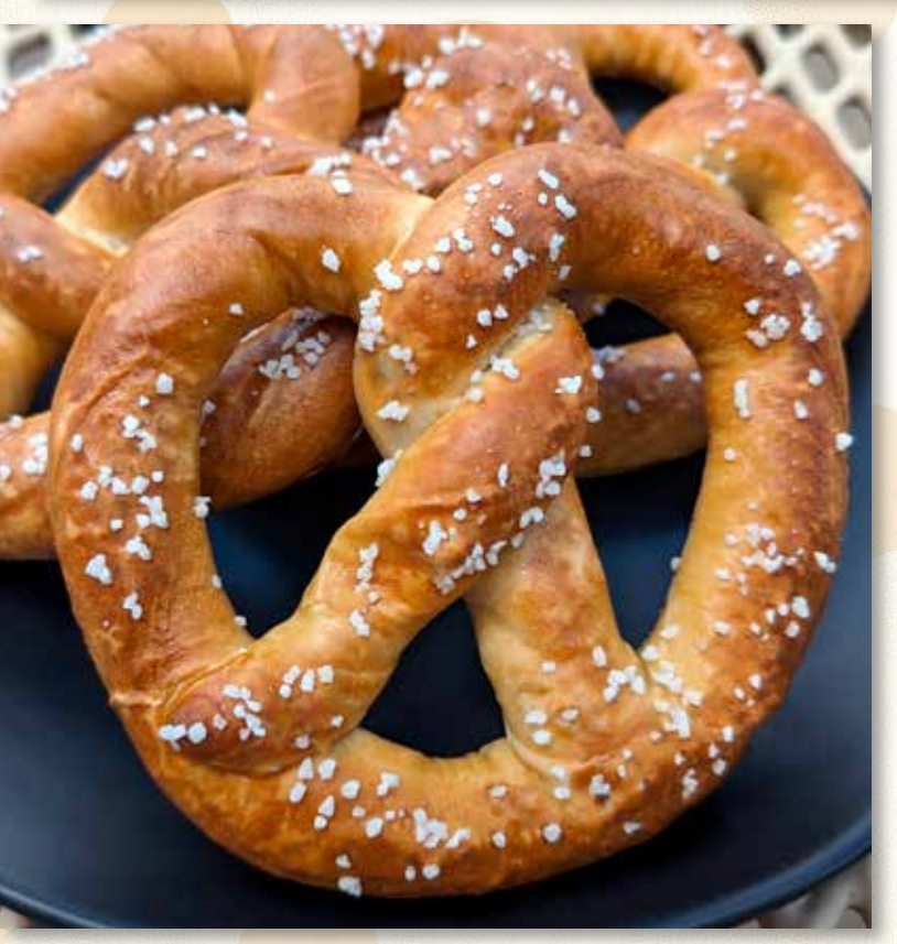
910 - Soft Pretzels

Serve warm with your favorite dips and toppings. Six 3½ ounce soft pretzels. Salt packet included.