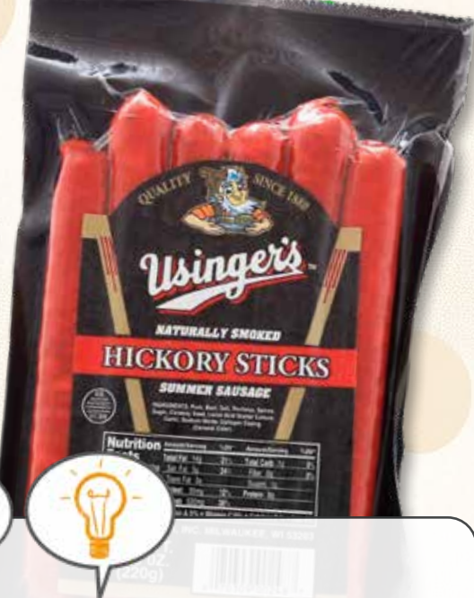
7162 - Hickory Sticks Protein packed snack made with the best beef and spices. Gluten free. 73/4 ounces.

Protein packed snack made with the best beef and spices. Gluten free. 8 ounces.