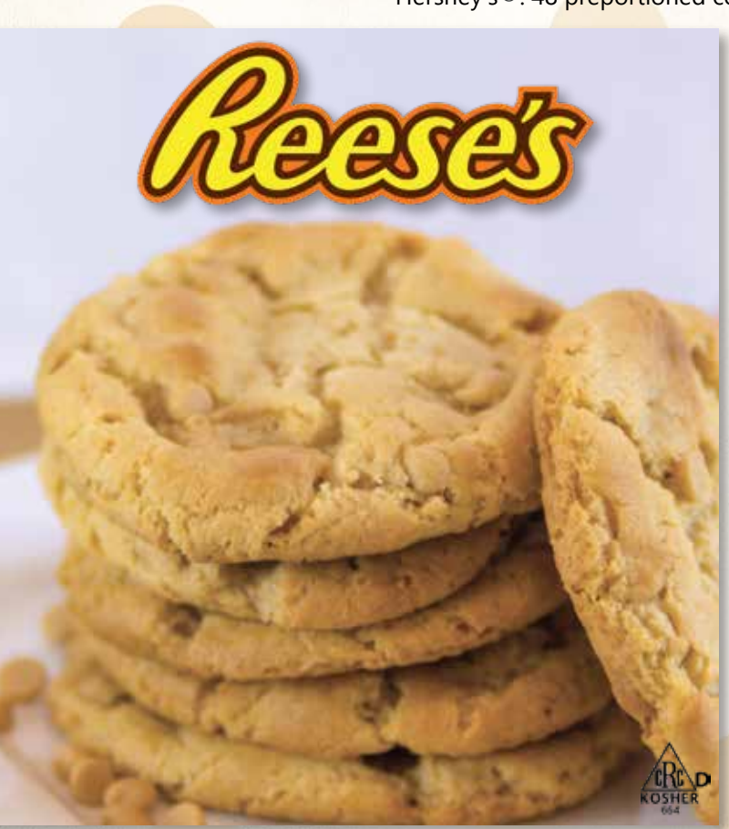
8003 - Peanut Butter with Reese's ® 2 pound box of preportioned 11/3 ounce cookies.