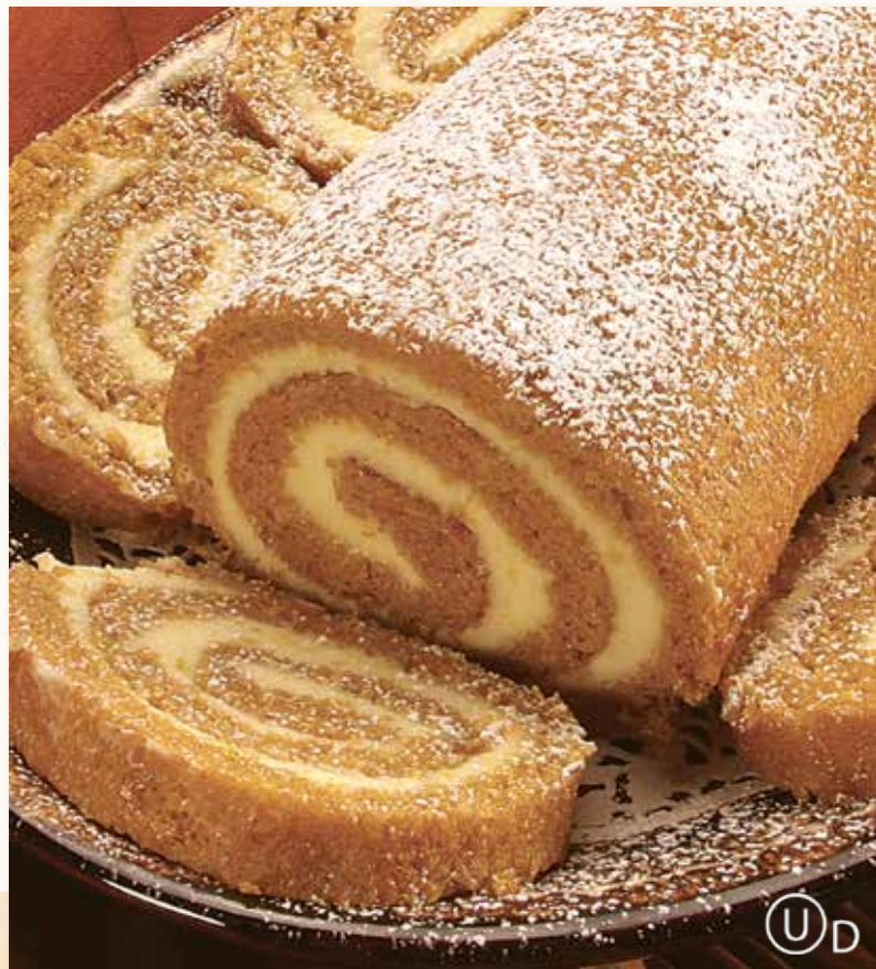
1216 - Pumpkin Roll A rich and moist pumpkin roll swirled with a luscious cream cheese filling. 8 inch roll.