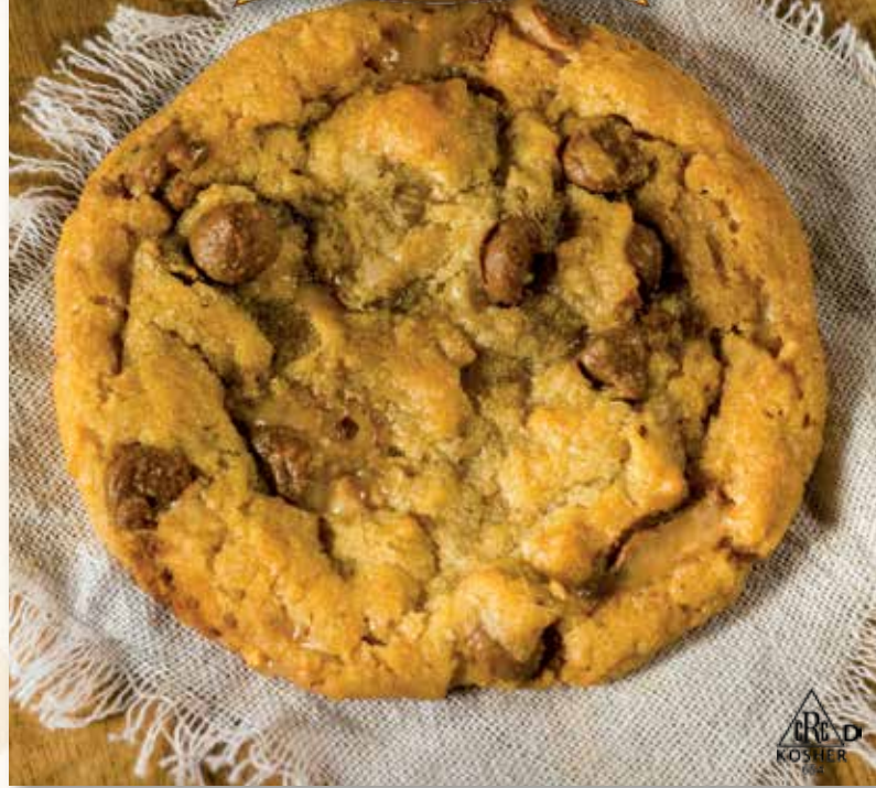
8518 - Chocolate Chip with Heath® 2 pound box of preportioned 1 1/3 ounce cookies.