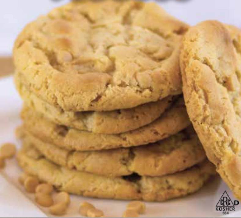
8003 - Peanut Butter with Reese's® 2 pound box of preportioned 1 1/3 ounce cookies.