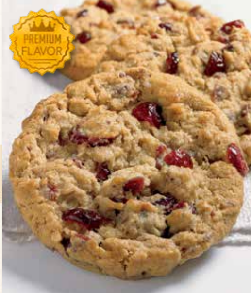
810 - Cranberry Oatmeal