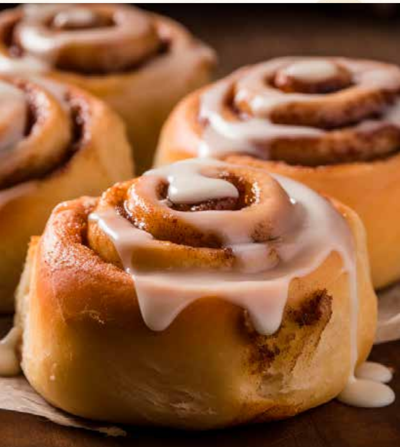
325 - Cinnamon Rolls The right combination of cinnamon & brown sugar! Topped with fondant icing. 20 ounce 4-pack.