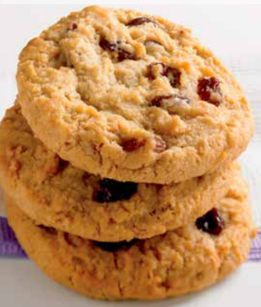
802 - Oatmeal Raisin