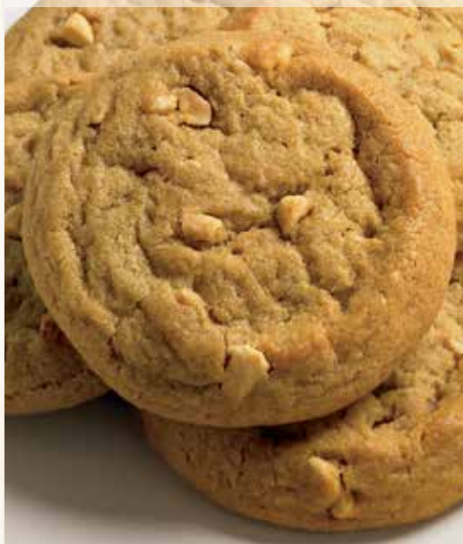
803 - Peanut Butter